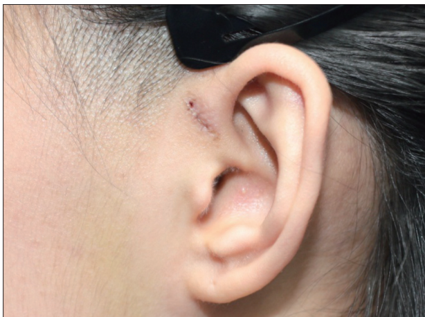
Fig. 3. Photograph of a 15-year-old patient on postoperative day 7.

There are a few limitations in our study. The retrospective study