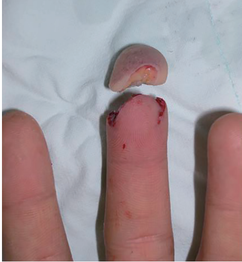
Fig. 1. A preoperative clinical photograph. The preoperative clinical photograph shows volar oblique amputation in zone I.