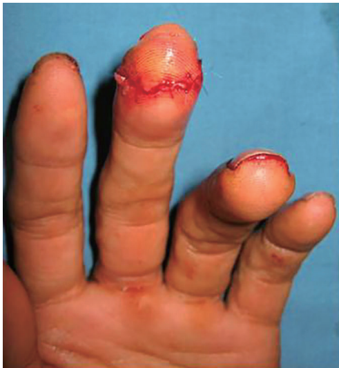
Fig. 2. An intraoperative clinical photograph. This clinical photograph taken immediately after the surgery shows successful replantation.