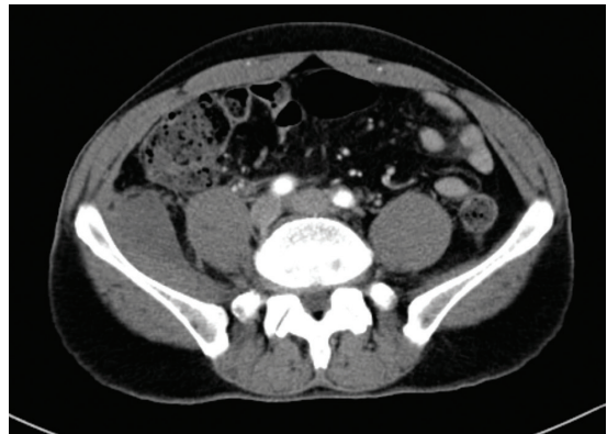
Fig. 4. A computed tomography (CT) image shows the regression of the hematoma. After 7 days, a CT image shows the regression of the hematoma of the right iliacus muscle.

the patient complained of sudden pain in the right flank. The pain was sudden in onset, was severe, and did not respond to analgesics, but femoral neuropathies such as muscle weakness, paresthesia, and paralysis were not present. Although the patient's vital signs were stable, a laboratory test showed that the hemoglobin levels had dropped from 11.6 to 10.1, and then to 9.6 g/dL, within 12 hours. The leukocyte count was normal (7,800–9,520 mm 3 ) and aPTT was delayed at 98.8 seconds. The computed tomography (CT) scan of the abdomen revealed an 8 cm × 3.6 cm hematoma of the right iliacus muscle combined with perilesional fluid collection and the widening of the retroperitoneal space and anteromedial displacement of the psoas muscle (Fig. 3). Fortunately, the hematoma was determined to be non-active bleeding