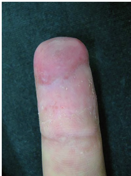
Fig. 5. A postoperative clinical photograph. The volar aspect of the middle finger (6 weeks after replantation) is well healed.

Iliopsoas hematoma is a rare complication associated with bleeding diathesis, trauma, and anticoagulant treatment [4]. Although hemorrhage is usually unilateral, a few cases report bilateral hematoma [1,2,5]. Diagnosis is based on clinical features and imaging studies, such as ultrasonography and CT [2,5]. Contrast-enhanced CT is the most sensitive method for the confirmation of hematoma. Early diagnosis is important because early treatment results in better recovery and fewer complications [4,5]. The treatment of iliopsoas hematoma starts with conservative management, including bed rest, volume replacement, and drug discontinuation. Conservative management is usually sufficient in cases with small hematomas and mild femoral neuropathy associated with non-active bleeding [2,5]. However, for patients with severe hemorrhage and intensive neurological symptoms, surgical