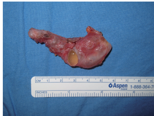
Fig. 3. The mass is about 5 cm × 3 cm in size and has a stalk attached to the lateral ligament of the knee and contains a gelatinous material.

There are many crucial structures in the popliteal fossa, namely popliteal artery and vein, tibial nerve,