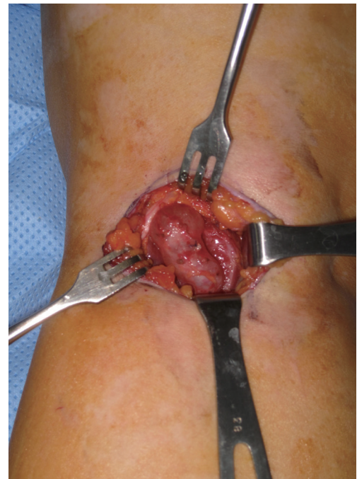
Fig. 2. Intraoperative field; the intramuscular ganglionic cyst is seen in the lateral head of the gastrocnemius muscle.