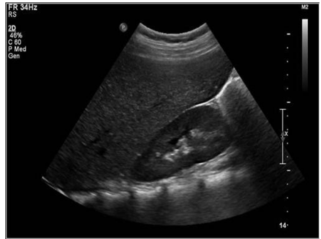
Fig. 3. Abdominal ultrasonography showing hepatomegaly with increased hepatic echogenicity.