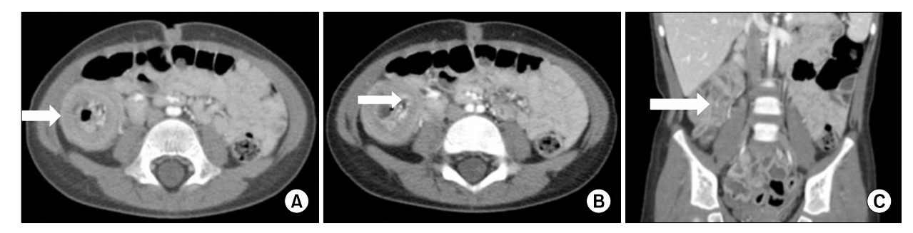
Fig. 2. Abdominal pelvic computed tomography. (A) Intussusceptions: ileocolic type intussusception without strangulation and significant obstruction (axial view, arrow). (B, C) Appendicitis: diffuse and mild wall thickening of the appendix partially trapped in the intussusception (B: axial view, C: coronal view; arrows).