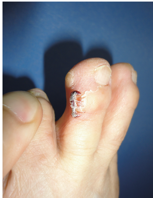
Fig. 1. Preoperative clinical view. 72-year-old female patients visited our hospital with chief complaint of 1 cm sized round and protuberance skin lesion which had a indetermined margin on dorsolateral aspect of third toe on left foot.

On histopathologic examinations, the patient was diagnosed with chondroma characterized by the