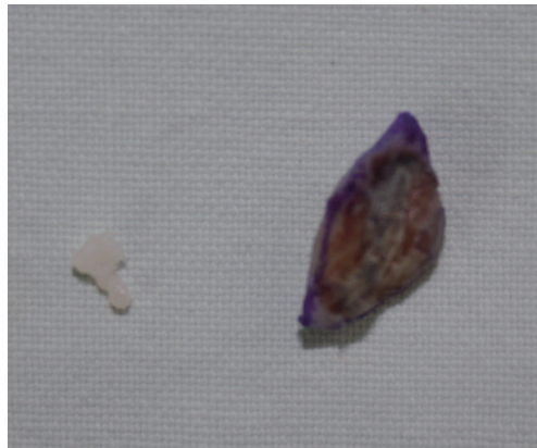
Fig. 3. Including calcified lesion, 1.0 x 0.8 cm sized mass excision was performed.