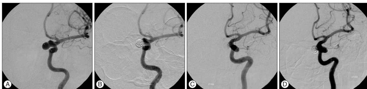
Fig. 1. Cerebral angiograms of a 44-year-old woman showing minor change. A : A left ICA angiogram shows a paraclinoid wide-necked aneurysm. B : An immediate angiogram after coil embolization shows near complete packing. C : An angiogram obtained 10 months later shows contrast filling in the aneurysm neck (minor change). D : A follow-up angiogram at 58 months shows neck filling, but no more severe compaction. ICA : internal carotid artery.