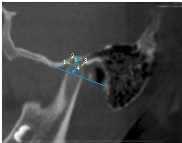
Figure 1. Anterior (1), superior (2), and posterior (3) joint spaces and the mandibular fossa depth (4) on a sagittal image of the right temporomandibular joint.

Subsequently, the midsagittal plane was determined in the coronal and sagittal sections as a plane perpendicular to the anterior nasal spine-posterior nasal spine line and an axial image was constructed. From the axial image, the following linear measurements were made (Figure 2): Greatest anteroposterior diameter of the mandibular condyle; greatest mediolateral diameter of the mandibular condyle; angle between the long axis of the mandibular condyle and the midsagittal plane; vertical distance from the geometric centers of the condyles to the midsagittal plane.