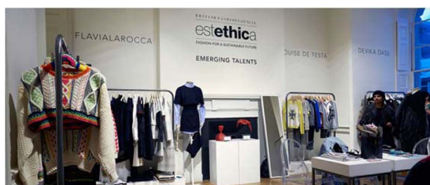
Fig. 5. The Emerging Talents Showroom for new designers (September 14, 2014).