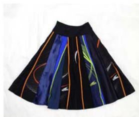
Fig. 1. From Somewhere and Speedo collaboration dress. fromsomewhere.co.uk .

From Somewhere has, since then, made clothes such as dresses and leggings by using these high-tech swimsuits and fabric (Fig. 1). This shows the possibilities of utilizing one company's excess stock by collaborating with other companies instead of throwing it away.