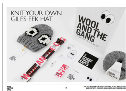
Fig. 7. Wool and the Gang tool kit for the user maker. woolandthegang.com .

Fourthly, sustainable fashion has come to be included in mainstream fashion in terms of aesthetics and commercial competitiveness. Until the mid-2000s, it emphasised ethics rather than aesthetics. David Shah, the fashion designer, trend watcher and moderator at the Beyond Green fashion symposium, pointed out that 'everybody was in eco fashion looked like a bag of potatoes' (Brand, 2008). In fact, because more weight used to be attributed to sustainability itself, fashionable aesthetics or commodity value were underestimated in sustainable fashion.