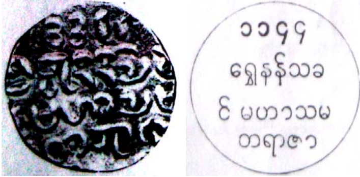
<Figure 2> Coin of Mahāsammata Raja (c.1782-1784)