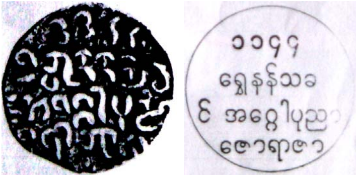
<Figure 3> Another Coin of Mahāsammata Raja as Agaw Punya Saw Raja (c.1782-1784)