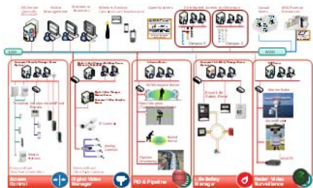
Fig.2. Experion Industrial Security (EIS) system architecture form Honeywell company