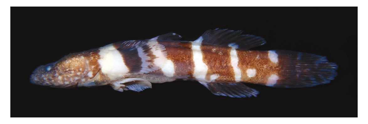
Fig. 2. Astrabe fasciata, NIBR-P30748, 34 mm SL, from the Dokdo of East Sea, Korea.

bedded scales, cover posterior part of body, extending on sided almost to base of pectoral fin. Dorsal fin separate; first dorsal fin with 3 spines, second with 11 rays. Anal fin with 10 rays. Upper rays of pectoral simple, with free tips. Pelvic fins I, 5, all connected; free from the body posteriorly. Color black, noticeably marked with white (Jordan and Snyder 1901; Lindberg and Krasyukova, 1989).