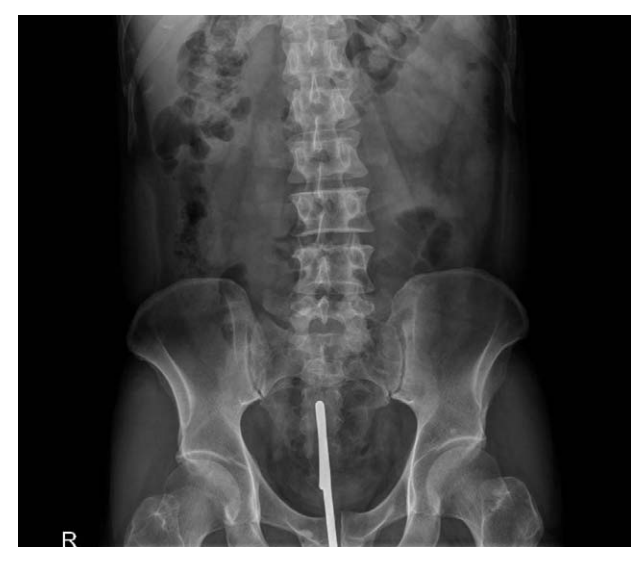
Fig. 4. Abdominopelvic CT, sexual toy glass in rectum.

When you meet the patient with rectal foreign