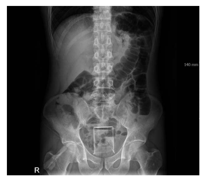
Fig. 1. Pelvic X-ray, metal ring in pelvis.

Between January 2005 and January 2015, 6 of total trauma patients 40034 (incidence: 0.015%) were treated for foreign bodies in the colorectum. All of them were male, the range of ages was 14\sim49 years old and mean age was 39. Three patients had rectal foreign bodies, two patients had foreign bodies in anus and one inserted a spray cap in his sigmoid colon through the anus. Two of three patients with