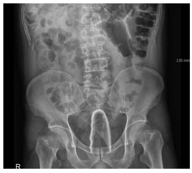
Fig. 2. Pelvic X-ray, laboratory beaker in pelvis.

rectal foreign bodies for their curiosity went to see the physician two days later. Only one patient had the past history of a psychiatric disorder – attention deficit hyperactivity disorder (ADHD). In all six patients, a 14-years-old boy with ADHD history and a 45-years-old man had the flash light and the metallic ring (Fig. 1) in their rectum accidentally when they were slipping. The remnant patients inserted various things (laboratory beaker (Fig. 2), sausage ( 25 \times 5 cm), spray cap, and sexual toy glass ( 12 \times 3 cm) (Fig. 3, 4)) by-themselves. We summarized age, location, days of hospital stay, and anesthesia methods in Table 1 and presented several radilogic images in Fig. 1 to Fig. 4.