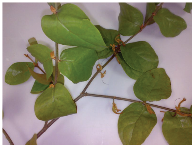
Figure 1 Loranthus ferrugineus Roxb.

Slenders of the bush, young parts, are described to be inflorescences [54]. Branches and twigs of the herb are long, pendulous, and densely clothed with L. ferrugineus down when young, in addition to the underside of the leaves, pedicels, calyxes, and corollas. The rusty colored leaves are opposite in direction, positioned on short petioles, elliptic, obtuse, coriaceous, and glabrous above [55]. These leaves are elliptic, with 4 - 8 cm long inder surfaces densely cov-