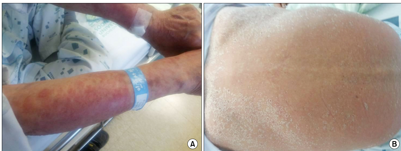
Figure 3. Recurrence of generalized skin lesion including rash and exfoliation following re-challenging of isoniazid. Arm (A) and back (B).

So we diagnosed DRESS syndrome after re-challenging INH, anti-tuberculosis drug. We discontinued challenging drug, INH, and prescribed systemic corticosteroids (intravenous methylprednisolone 2 mg/kg/day for 5 days, tapered over 2 weeks). Eventually he fully recovered after stopping INH and administration of systemic corticosteroids. He have taken secondary anti-tuberculosis drugs (RFP and streptomycin, and moxifloxacin) and followed up for 3 months without any other complication.