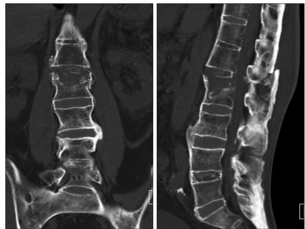
Fig. 1. Chance fracture on the L2, presenting on preoperative CT scan. There are fractures of the lamina, spinous process, and vertebral body with a canal compromise on CT scan. The findings of ankylosing spondylitis including syndesmophyte, bamboo spine are shown in CT scan.

netic resonance (MR) images showed chance fracture on L2 with syndesmophyte, bamboo spine and sacroiliitis, implying ankylosing spondylitis. He underwent posterior fusion and pedicle screw fixation from T12 to L3 level with allo- and auto-graft bone five days later since the accident, recovered from neurologic deficit and became an ambulatory.