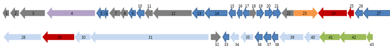
Fig. 2. Schematic representation of the dsDNA genome of the phage SMSAP5. Putative ORFs are presented as arrows, with predicted functions where available. Proposed modules are based on predicted functions. Grey, replication; purple, virulence; orange, lysogeny; red, lysis; pale blue, morphogenesis; green, DNA packaging.

In conclusion, we analyzed morphological property and genome sequence of phage SMSAP5 isolated from soil of slaughterhouses for cattle. Newly isolated phage SMSAP5 for S. aureus was slightly different to genome sequence of any other phages of the members of S. aureus . Lately,