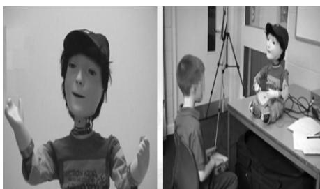
[Fig. 2] KASPAR - England

As for the US, there has been a case study supporting the success of using robots as a facilitator to teaching. A controlled robot-facilitated teaching session for over 6 months in primary, secondary and tertiary institutions have reported success, for the students' mathematics classes. In addition to the above, US is continuously researching to develop a state-of-the-art robot that incorporate a human's emotions and psychological aspects into its AI via the use and study of MIT's robot Kismet and alike.