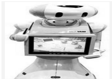
[Fig. 6] The Korean VANI (VANI)

VANI, is a tele-presence based robot equipped with an online learning program on an upper-half monitor, designed to teach English in listening, talking, reading and writing. The native teacher from overseas can also monitor the progress via wireless LAN to teach the English classes real-time.