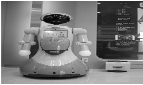
[Fig. 5] TIRO - Republic of Korea

VANI, is a tele-presence based robot equipped with an online learning program on an upper-half monitor, designed to teach English in listening, talking, reading and writing. The native teacher from overseas can also monitor the progress via wireless LAN to teach the English classes real-time.