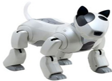
[Fig. 7] The Genibo edu

The robot used for this research is 'Genibo Edu', developed by A Corporation, Republic of Korea. Sized at 192mm×334mm×300mm, weighing 1.6kg. It is a biomimetic AI based robot, designed to reflect the behaviours of a dog through the state-of-the-art technology. Its merit is that it can mimic the behaviours of pets, that are, in reality hard to raise within a pre-school environment.