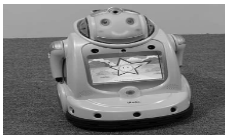
[Fig. 4] iROBIQ - Republic of Korea

In Korea, IROBIQ, a robot equipped with voice recognition and pre school education contents went into commercialization as of December 2008 to be used around pre-schools as teacher aide robots. IROBIQ is an URC concept robot, capable of security, communication, play and education functions all achieved via wireless network connection. It is capable of expressing emotion via LED facial expression, simple commands, voice recognition and self-mobility.