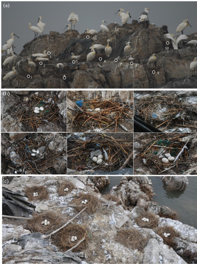
Fig. 4. Black-faced Spoonbills on Suhaam Islet in 2010 (a), and examples of nests observed in 2010 (b) and 2011 (c). Open circles indicate the locations of the nests alongside the serial numbers allocated for the study. After natural materials were provided through conservation efforts early in the breeding season of 2011, the use of plastic debris as a nesting material decreased compared with that in 2010.

Lavers et al. [2013]; Votier et al. [2011]).