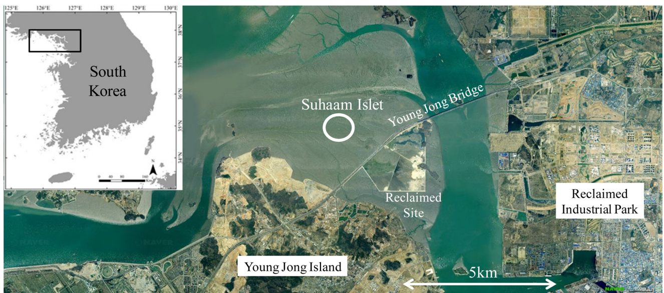
Fig. 1. Location of Suhaam Islet, the surveyed breeding site of Black-faced Spoonbills in South Korea. The islet is located on a tidal flat near a metropolitan city, where there are abundant predators, human activities, and marine debris.

Suhaam Islet measures only approximately 1,400 m 2 in area, with a length of 70 m and width of 20 m at low tide (Fig. 2). At high tide, the length of the islet above the water level is reduced to