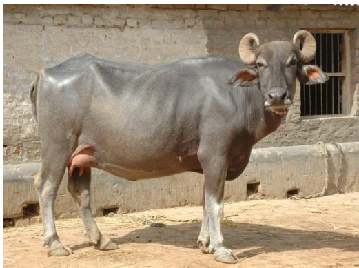
Figure 1. Adult female Gojri buffalo with typical phenotype and Characteristic horn orientation.

Data consisted of 13 different body measurements