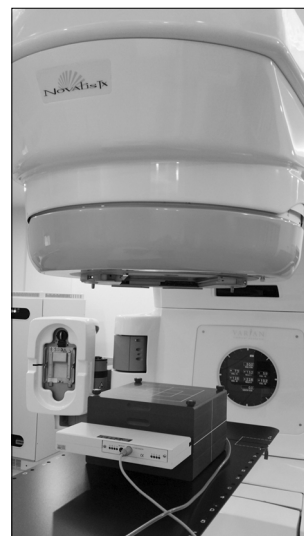
Fig. 4. MapCHECK combined with MapPHAN phantom for the dose measurement in RapidArc treatment.

The additional ten RapidArc plans were prepared with the same MapCHECK phantom, target, OARs and dose prescription as used in the TomoTherapy plans. The DQA plans were prepared for dose measurement by using the ArcCHECK. After the DQA accuracy was confirmed, the measured dose data by using the ArcCHECK was imported to 3DVH for 3D dose calculation in the MapCHECK phantom. The calculated 2D coronal dose distribution at the level of MapCHECK diode detector array was exported, as in the case of the TomoTherapy analysis. The dose difference between the dose meas-