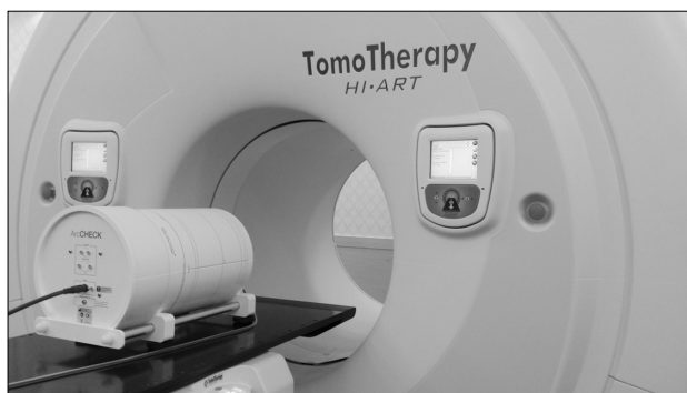
Fig. 3. Dose measurement with ArcCHECK for the TomoTherapy delivery quality assurance (DQA).