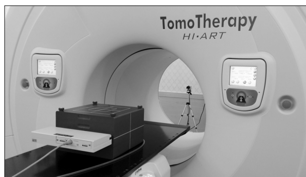
Fig. 1. MapCHECK combined with MapPHAN phantom for the dose measurement in TomoTherapy treatment.

The DQA plans of the prepared TomoTherapy plans were made for the acquisition of measured dose data by using the ArcCHECK device. After the DQA measurement by using the ArcCHECK, as shown in Fig. 3, the error compared with the calculated dose in the TomoTherapy planning system was evaluated using the gamma evaluation method with a 3% dose difference and 3-mm distance-to-agreement criteria. The measured dose data by using the ArcCHECK was imported to 3DVH, and the 3D dose distribution in the MapCHECK phantom was recalculated. The calculated 2D coronal dose distribution at the level of diode detector array was exported in order to compare it with the dose distribution measured in the MapCHECK detector array during the TomoTherapy treatment beam delivery.