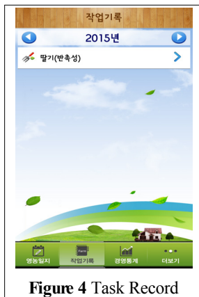
Figure 4 Task Record

The task record menu is a corner configured to modify when necessary after checking the task details entered by users in a clearly organized way as shown in <Figure 4>. This menu can check task details by year and crop as a menu used while checking what work was recently done on each crop.