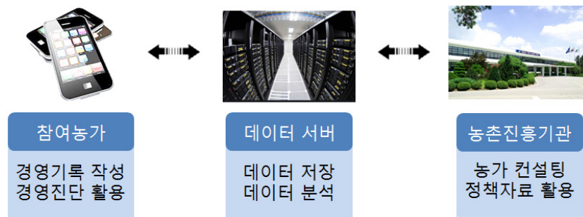
Figure 24 Smartphone Farm Management Record Book System Overview