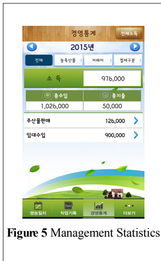
Figure 5 Management Statistics