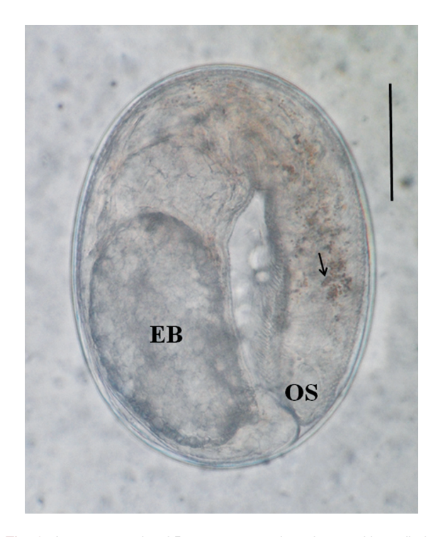
Fig. 2. A metacercaria of Procerovum varium detected in a climbing perch, Anabas testudineus , from a local fish market of Vientiane Municipality, Lao PDR. It is elliptical and 175 \times 136 μm in average size, and has brownish pigment granules, a muscular oral sucker (OS), a pair of eyespots (arrow) lateral to pharynx, a ventral sucker deflectively located from median, a thick-walled expulsor, and a D-shaped excretory bladder (EB) with grouped granules. Scale bar is 50 μm.

Trematodes in the genus Procerovum (Heterophyidae) are characterized by possessing a single testis and a long prominent seminal vesicle modified into an expulsor. Only 3 species, i.e., P. varium , P. calderoni , and P. cheni , have been certified for their validity based on the morphology of the seminal vesicle. Our specimens (304 \times 186 \ \mu m) were somewhat smaller