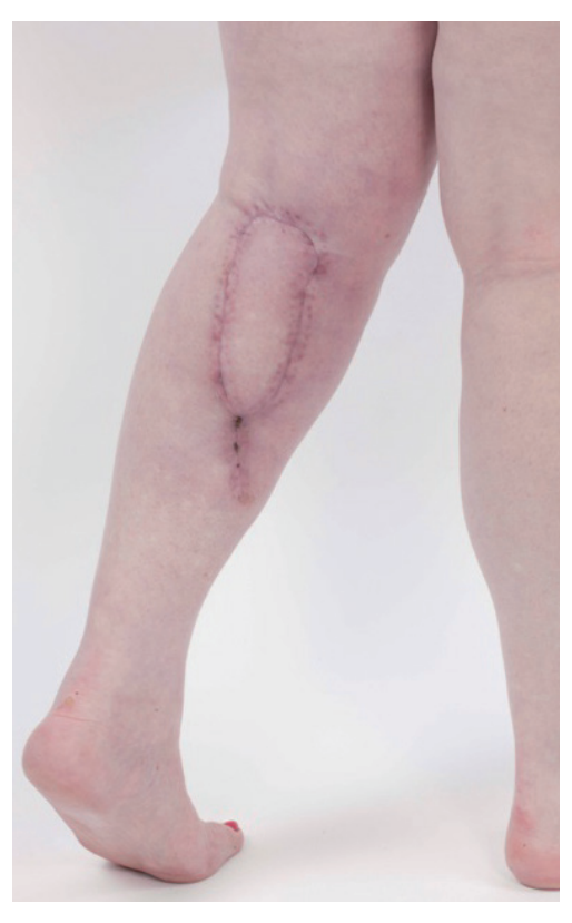
Medial sural artery perforator flap 4 months postoperatively.

thickness. The resulting defect was 5 cm \times 5.5 cm (Fig. 1). Handheld Doppler was used to locate and mark the perforators preoperatively across the medial head of gastrocnemius. Although more accurate methods can be used to map the perforator, handheld Doppler offers time efficiency and reduces input from radiological investigations [4]. Flap harvest commenced with an incision placed above the medial border of the medial head of the gastrocnemius. A branch of the long saphenous vein superficial to the fascia was encountered and preserved and seen to enter the medial side flap (Fig. 2). Two perforators were identified. The vein was mobilized free from the lateral skin flap to provide enough mobility for flap advancement. The flap was raised subfascially from distal to proximal with identification and preservation of two MSAP (Fig. 3). The two perforators were skeletonised with minimal intra-muscular dissection.