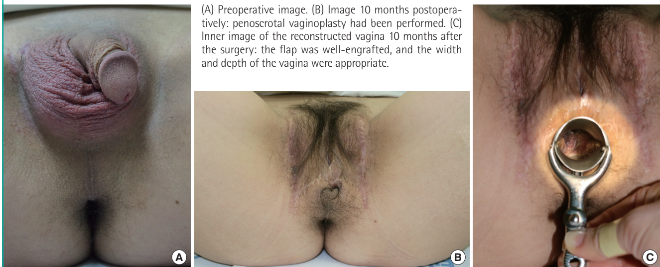
Fig. 1. Case 1: Penoscrotal vaginoplasty

(A) Preoperative image. (B) Image 10 months postoperatively: penoscrotal vaginoplasty had been performed. (C) Inner image of the reconstructed vagina 10 months after the surgery: the flap was well-engrafted, and the width and depth of the vagina were appropriate.