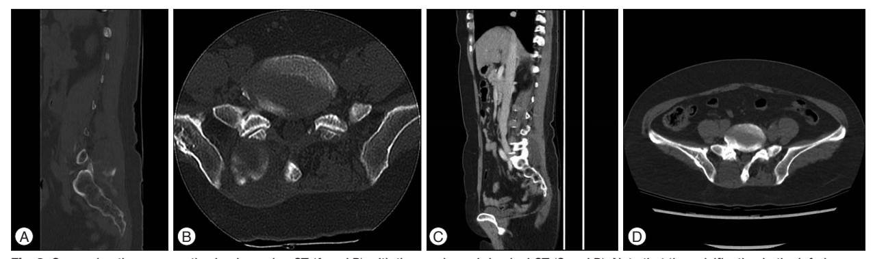
Fig. 2. Comparing the preoperative lumbar spine CT (A and B) with the previous abdominal CT (C and D). Note that the calcification in the inferior portion of the mass (A and B), which was not detected on the abdominal CT examined 4 months ago.

been reported at the various locations such as thighs, buttocks, upper limbs, shoulders, and paravertebral area. Of those IMs, paraspinal regions are the most uncommon site, and so far, only 14 cases of paraspinal IMs have been reported. And to the best of our knowledge, this report is just the eighth case of paraspinal