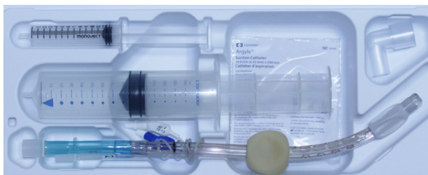
Fig. 1. The Combitube kit (37 Fr, Mallinckrodt, USA).

had no specific underlying medical problems. He was scheduled for two-jaw surgery as a result of malocclusion. With the use of facial computer tomography, it was determined that the patient had an upper airway obstruction that extended from the pharynx to the larynx. After arriving in the operating room, the patient was monitored with a bispectral index, an electrocardiogram, an automated noninvasive blood pressure device, and pulse oximetry. For the induction of anesthesia, an intravenous injection of propofol (120 mg) and rocuronium (50 mg) was used. Nasotracheal intubation was performed with no specific difficulties. Arterial cannulation was performed via the dorsalis pedis artery for monitoring arterial blood pressure and performing a blood test. Additionally, a 16-gauge cannula was placed in the great saphenous vein for venous cannulation. Total intravenous anesthesia was maintained using propofol and remifentanyl. During surgery, no special events occurred and the vital signs and oxygen saturation of the patient were normal.