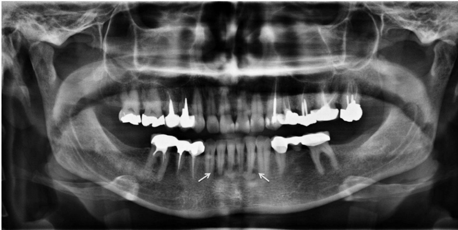
Fig. 1. A panoramic radiograph shows a radiolucent rim at the periphery of lesions (arrows) diagnosed as periapical cemento-osseous dysplasia.

multiple periapical radiopacities, and (F) active hypercementosis in multiplex form. They studied the radiographic findings of 54 patients, and found that Type D was the most frequent pattern, manifesting as lobular or spherical calcified masses enveloped by a complete or partial radiolucent rim. In partially radiolucent rims, calcified masses were in close proximity to the peripheral bone without any association with the neighboring teeth. Type C was the second most common pattern, occurring in 35% of cases. The pathognomonic radiographic features in the diagnosis of cemento-osseous dysplasia lesions are features C and D. The presence of a radiolucent rim at the periphery of radiopacities is also very significant for diagnosis. 8