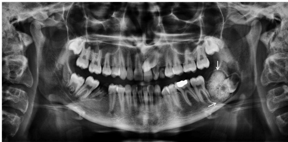
Fig. 5. A complex odontoma with a radiolucent rim in conjunction with a corticated border around the lesion (arrows).

pattern, and is not relieved by aspirin or other non-steroidal anti-inflammatory drugs, as is the case for osteoid osteoma. 31 A combination of radiopaque and radiolucent patterns, depending on the degree of calcification and the absence of a perilesional sclerotic border, is a common radiographic feature for osteoblastoma. 30 Jones et al. 31 found that more than half of the cases analyzed in their study had mixed or complete radiopaque patterns. Manjunatha et al. 28 reported similar findings.