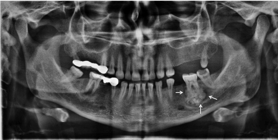
Fig. 6. Cementoblastoma is seen at the periapex of the left second mandibular molar. A radiolucent halo is apparent at the periphery of the lesion (arrows).

origin. 41-43 Cementoblastoma originates from the roots of teeth, and is marked by the formation of cementum-like tissue. 44,45 Clinically, the lesion appears as a nodular expansive mass in the alveolar ridge area that is hard to elastic in consistency. 45 The tumors have been reported to range in size from 0.5 cm to 5.5 cm, with a mean diameter of 2.1 cm. 46 Cementoblastoma is usually asymptomatic and is generally detected upon radiographic examination. 42,43 Symptoms may be completely absent, but if present, pain, swelling, and cortical expansion are frequent findings. 42,47,48 Paresthesia of the lower lip or pathologic fracture of the jaws rarely occurs. 42-48 It can also act in a locally aggressive manner, resulting in bony expansion, root resorption, displacement of adjacent teeth, and jaw deformity. Jaw expansion and perforation of the cortex are common findings in recurrent tumors. 42 Most benign cementoblastomas occur in the mandible. 47,49 The mandible is affected three times as often as the maxilla. The most commonly affected tooth is the mandibular first molar, which remains vital. 47,48 Benign cementoblastoma has also been reported in the maxillary sinus, and is accompanied by deciduous and unerupted permanent teeth. 41,43,45 Caucasians are more commonly affected than blacks. The male-to-female ratio of its prevalence is 2.1 : 1. Young adults in their second and third decades of life are most commonly affected. 41-48