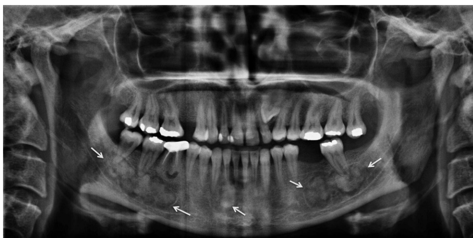
Fig. 3. Florid cemento-osseous dysplasia is situated at the right, left, and anterior portions of the mandible, surrounded by a radiolucent rim (arrows).