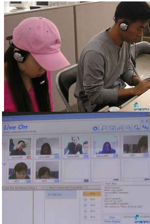
(Figure 1) On-line Chatting Activities

N1 Comments [2015/05/18 09:12:51] : difficulties in communicating with foreign students W1 Comments[2015/05/18 09:13:11]: hmm.. N1 Comments [2015/05/18 09:13:17] : do you guys have any difficulty? N2 Comments [2015/05/18 09:13:46] : well, the manners are different so it is hard to act the right manner. N2 Comments [2015/05/18 09:14:03] : like for example, americans are individualistic W2 Comments [2015/05/18 09:14:05] : our backgrounds different, so it's difficult to communicate with foreign country