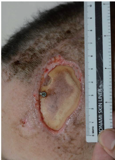
Fig. 1. This 52-year-old female was suffering from a pressure sore on the scalp region.

Under general anesthesia, the wound was debrided, after which the defect measured 8×6 cm. The wound was carefully explored, and the superficial temporal artery was followed from a proximal to distal course until we were able to find an appropriate recipient vessel about 3 cm away from the inferolateral margin of the defect.