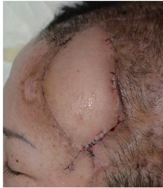
Fig. 4. Two weeks after the surgery. The flap survived without any signs of congestion.