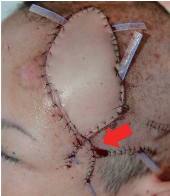
Fig. 3. Immediately after the reconstruction. The open end of the vein was monitored every 2 hours for continued blood drainage (red arrow).

Venous congestion is more common than arterial insufficiency after free flap transfer. Improperly managed venous congestion may result in flap necrosis. In order to prevent flap necrosis due to congestion, the flap should be allowed to drain the venous blood