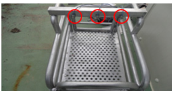
(b) Locations of the infrared sensors