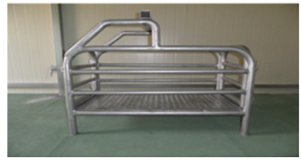
(a) A side view of the stall

The experiment was performed after giving the pigs an adaptation period of one week. The body temperature of the pigs at feeding time was recorded every second using an infrared sensor. The infrared sensor used was MI310LTSCB (Raytek, U.S.A), and its specifications are as follows: accuracy, \pm 1\% of the reading or \pm 1^{\circ} C, whichever was greater; temperature resolution, 0.1°C or 0.2°F. These infrared sensors were installed on the self-made stall (Figure 2) in such a manner as to face the pigs' backs