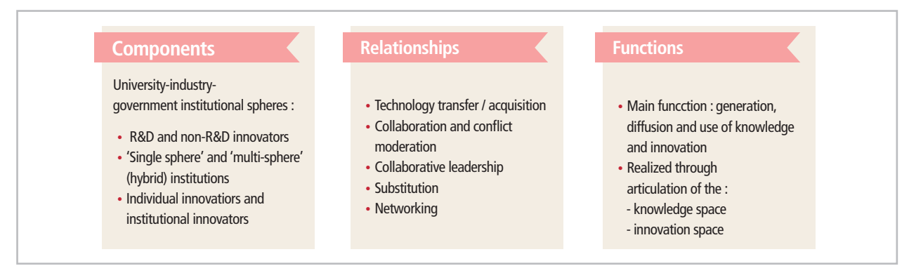
Fig. 2. A synthetic representation of Triple Helix system