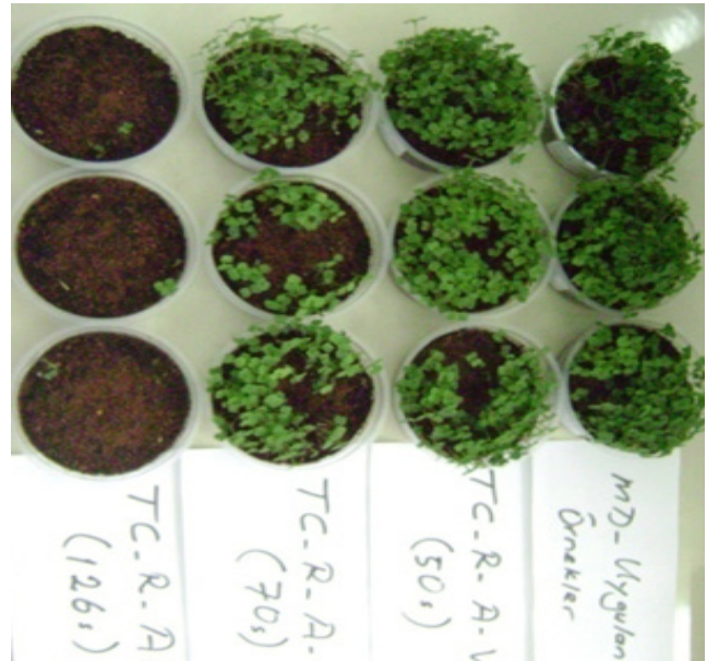
Figure 6. 126 s, 70 s, and 50 s microwave-applied and non-applied arugula seeds, respectively, at day 6.

To test the germination inhibition effect on another type of seed, arugula seeds were planted in a turf-soil compound at equal depths and were subjected to microwave treatment with a power level of 2.8 kW for 126 s, 70 s, or 50 s. The germination rates of microwave treated and untreated arugula seeds were compared on the on the fifth and sixth day post-exposure, and are shown together