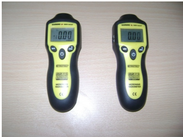
Figure 3. Microwave leakage detector.

The microwave treatment tunnel was constructed by mounting four 1-kW magnetrons to a galvanized steel tunnel frame with the dimensions of 125 × 60 × 40 cm. The microwave output power of each magnetron is 700 W (Figure 2).