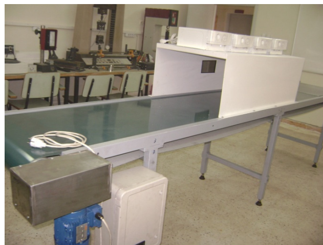
Figure 1. Conveyor belt, 4 kW microwave tunnel, and driver unit.

A variable-speed conveyor belt (approximate dimensions: 4.5 m in length, 60-cm band width, and 70-cm height) and the Power F 4M motor drive with a frequency range of 0.01–1.00 Hz was used in combination to simulate the speed of a tractor moving across the cropland (Figure 1).