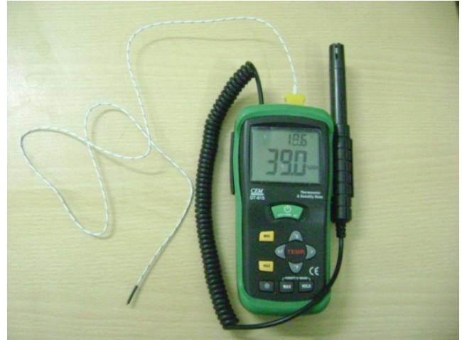
Figure 4. Thermometer and humidimeter digital thermocouple.

Two BR15 model microwave detectors were placed in separate locations during experimental runs and were used to detect microwave energy leakage and to determine whether this leakage exceeded the 5 mW/cm security limit that was established by the FDA (U.S. Food and Drug Administration) and the EPA (U.S. Environmental Protection