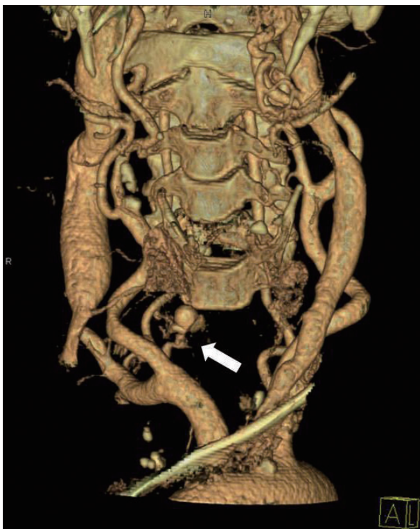
Fig. 1. Neck computed tomography angiogram immediately after temporary hemostasis showing a saccular aneurysm (arrow) at the inferior thyroid artery.

A true aneurysm arising from the TCT is extremely rare. Although ITA aneurysm is the most common form of TCT aneurysm, there have been fewer than 25 cases reported in the literature 13 . Among these, only four cases were treated by coil embolization alone 4,5,9,10 . Various clinical manifestations of these aneurysms have been reported, including palpable neck mass, hoarseness, dysphagia, respiratory distress, or evaluation of a possible thyroid nodule 1,8,12,14 .