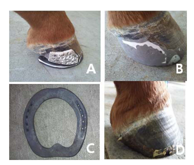
Fig 2. Stabilizing hoof wall that was fixed with a FRP plate by using screws and the foot that shod therapeutic shoe (A). Hoof appearance that was treated on 3rd therapeutic shoeing (B). A steel bar shoe that was shod at the 4th try of therapeutic shoeing (C) and hoof condition that cracks was disappeared on the quarter of hoof wall on the 48th weeks beginning of therapeutic shoeing (D).

from the 2 vertical lines of the crack area manifested. Because the crack did not improve with medicine, therapeutic shoeing was conducted at the Korea Racing Authority's farriery center 5 times at an interval of about 6 to 8 weeks after 11 weeks of the initial diagnosis in order to achieve a fundamental treatment, and training was started two weeks after the last therapeutic shoeing with the aim of competing in races.