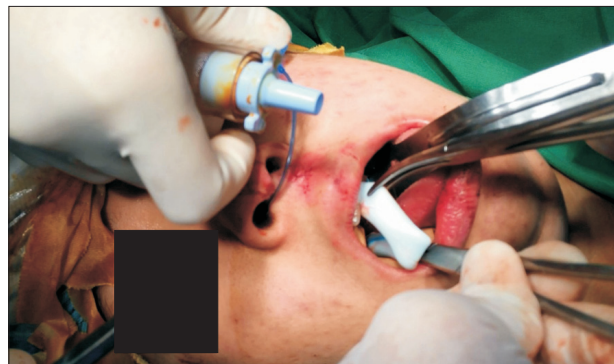
Fig. 3. Clinical photo showing the nasal tube being pulled and delivered orally. Notice the cuff inflation tube remains in the nose.

Jin Yong Cho et al: A simple method of intraoperative intubation tube change. J Korean Assoc Oral Maxillofac Surg 2014