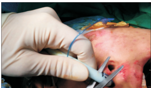
Fig. 2. Clinical photo showing the cutting of the nasal tube just outside of the naris.

Jin Yong Cho et al: A simple method of intraoperative intubation tube change. J Korean Assoc Oral Maxillofac Surg 2014