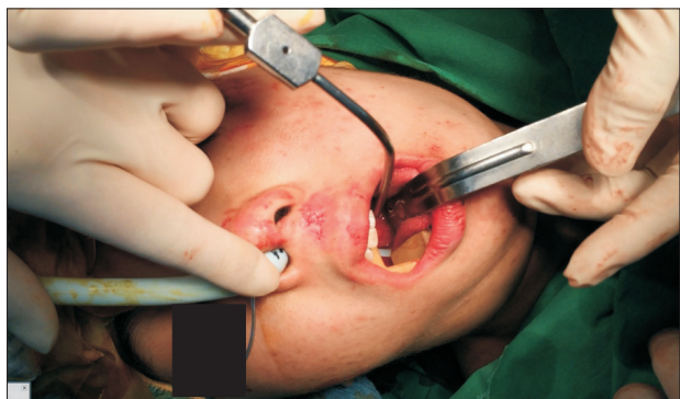
Fig. 1. Nasal endotracheal tube is placed. A long clamp was placed at the level of the tongue base.

Jin Yong Cho et al: A simple method of intraoperative intubation tube change. J Korean Assoc Oral Maxillofac Surg 2014