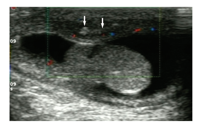
Fig. 1. Scrotal ultrasound showing that the left scrotal wall is thickened and there is a hetero-echogenic mass (arrows) measuring 11×3 mm with ill-defined margins.

nation identified that the left scrotal wall was thickened with a mixed-echogenicity mass measuring 11 × 3 mm, which had an obscure boundary and increased blood supply on color Doppler (Fig. 1). The mass was thought to be inflammatory in origin, and observation was recommended. However, repeat ultrasound examinations demonstrated the mass to be increasing in size. The last ultrasound examination revealed a 19×9 mm hetero-echogenic mass with ill-defined margins. Physical examination demonstrated a flat mass of the left scrotum measuring 20 \times 10 \times 3 mm, with non-homogeneous consistency, illdefined borders and no tenderness. CT showed a mass of 12×9 mm anterior to the left testicle, with heterogeneous density and punctate calcifications (Fig. 2A) and obvious enhancement after administration of contrast agent (Fig. 2B), which was diagnosed as a left testicular teratoma. The complete blood count (CBC), electrolytes, and liver function tests were all normal pri-