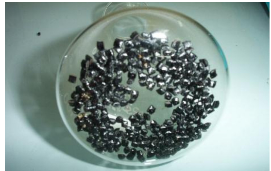
Figure 2. Nylon 66 clots on the flask( Product D )