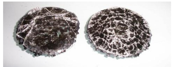
Figure 3. Nylon 66 clots on the flasks( Product B )