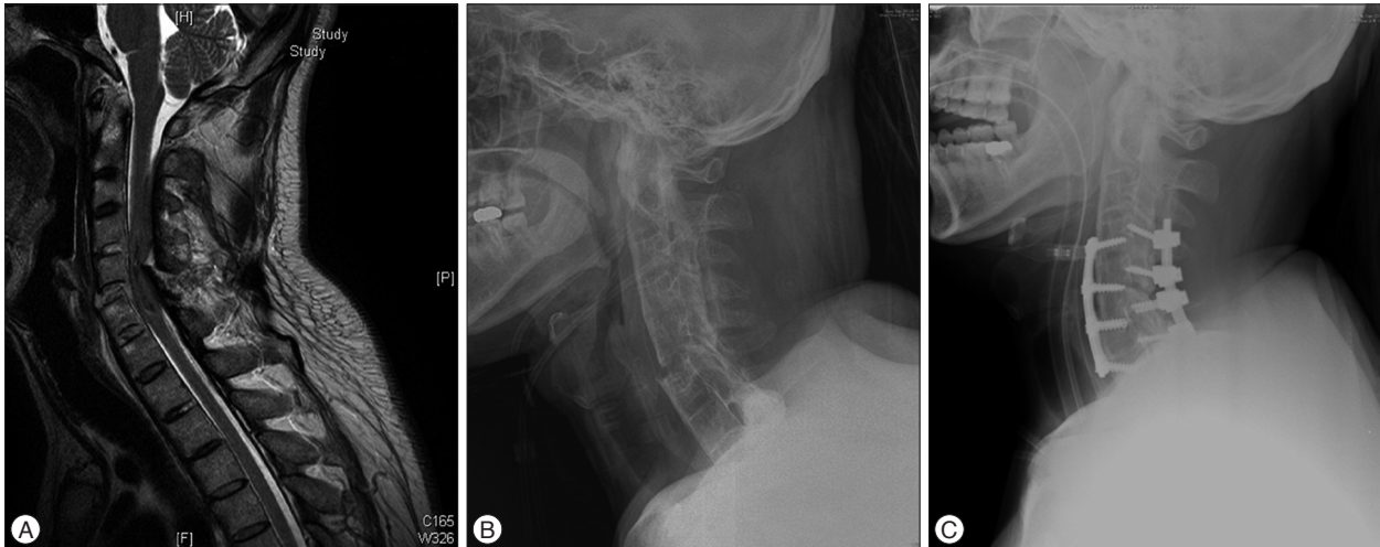
Fig. 1. Case 5. Imaging study obtained in 38-year-old man suffering from ankylosing spondylitis for 15 years. The patient had been transferred to our center from a local hospital after falling down in a drunken state. When he arrived at our hospital, his neurologic status was quadriplegia (ASIA grade A). The patient underwent emergent two-stage anterior-posterior fixation to stabilization. After a 1-year follow-up period, his neurologic status was not improved and he suffered aspiration pneumonia. After a tracheostomy, he was transferred to a rehabilitation center. A and B : Preoperative MR imaging and plain radiography showing C5–6 instability, spinal cord injury due to compromised canal from the C6 lamina, and so-called bamboo spine resulting from ankylosing spondylitis. C : Plain radiography demonstrating the outcome after two-stage anterior-posterior stabilization.

One patient had a prior fracture (case 10) and he underwent posterior decompression and fixation at a local hospital before being transferred to our hospital 1 month later because of a T11 fracture. During postoperative care at the local hospital, he suffered a bed-level falling down injury. By using plain radiography,