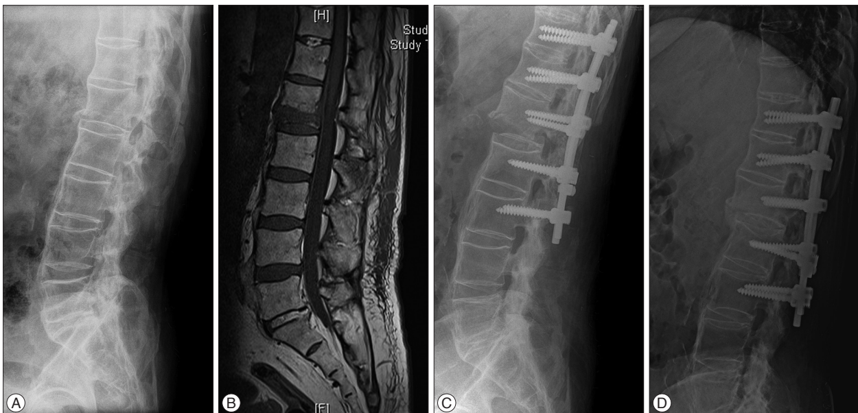
Fig. 2. Case 12. Imaging studies obtained in a 72-year-old man with known ankylosing spondylitis for 30 years. He experienced immediate bilateral leg motor weakness (ASIA grade C) from a fall-related injury at home. After surgery, the patient's neurological status was improved to ASIA grade E for 11 months of follow-up. A and B : Preoperative plain radiography and MR imaging reveal a flexion fracture and dislocation of L1. C : Immediate postoperative radiography after placement of pedicle screw from T11 to L3 and laminectomy L1, 2, 3. These figures show a structure of ankylosed spine like a long bone fracture and further displacement of the fracture site after surgery. It may have occurred in positioning the patient in the operating room. D : post-operative radiography for 11 months of follow-up demonstrating a fused state.