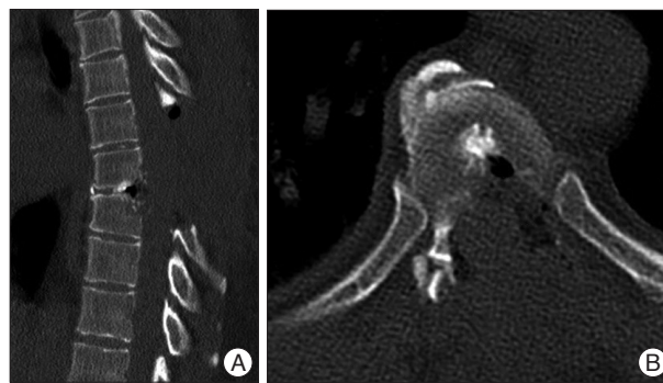
Fig. 3. Postoperative sagittal (A) and axial (B) CT with ample decompression of the spinal cord. T8 vertebral body defect is estimated at 10% of its total volume.

Surgical approaches for TDH have evolved dramatically since the first surgical report by Adson in 1922 4,13 . While laminectomy alone has been abandoned due to dismal neurological outcomes, the time-honored open transthoracic, transpleural approach still poses considerable challenges—an access surgeon, double-lumen endotracheal intubation, ipsilateral lung deflation and a chest tube are typically required. In a recent series of open transthoracic cases, Ayhan et al. report good neurological outcomes (90% improved or stabilized myelopathy) but some of the reported figures are concerning that this approach may not be applicable to the sickest patients: 605 mL mean EBL, four days of chest drainage and seven days in-hospital stay on average 3 . Pulmonary complications and post-thoracotomy pain are other concerns as well 10 . Anterior alternatives have then evolved in order to obviate some of these problems. VATS was