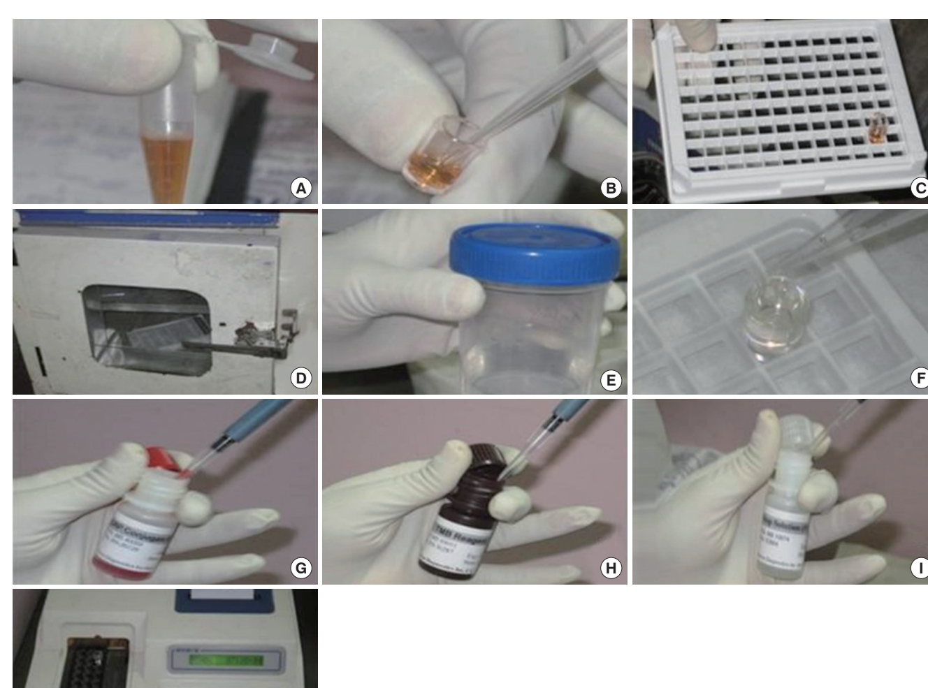
Figure 2. Gingival crevicular fluid C-reactive protein (GCF-CRP) analysis addition of CRP sample diluents to plastic vial containing GCF sample (A) addition of solution in the microtitre well (B) microtitre well in the microtitre plate (C) sample kit in incubator (D) distilled water (E) addition of distilled water in microtitre well (F) retrieval of CRP conjugate (G) retrieval of tetramethylbenzidine reagent (H) retrieval of stop solution (I) microtitre well kept in enzyme-linked immunosorbent assay reader (J).