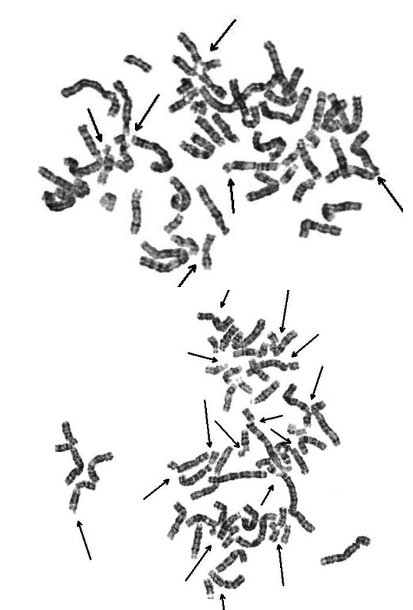
Fig. 1. Karyotype with induction of chromosome breakage by using mitomycin C, in patients diagnosed with Fanconi anemia (arrows: chromosomes with breaks, fusions, and radials).

Fanconi anemia (FA, MIM #227650) is a complex disease that can affect many systems in the body. FA is characterized by congenital abnormalities, progressive development of BMF, and an increased susceptibility to malignancy, including myelodysplastic syndrome (MDS), leukemia (especially acute myeloid leukemia [AML]) and solid tumors (particularly squamous cell carcinoma). Affected individuals often (but not always) present with physical abnormalities, including short stature, Fanconi facies and microphthalmia, thumb and radius deformities, skin pigmentation such as café-au-lait spots, and cardiac, renal, genitourinary, and/or other malformations<sup>1</sup>. Approximately 30% of patients with FA have no overt somatic abnormalities<sup>2)</sup>. The majority of patients present symptoms toward the end of their first decade of life. However, increasingly, patients are being diagnosed in adulthood and many patients diagnosed in childhood are surviving into adulthood<sup>3</sup>. Increased