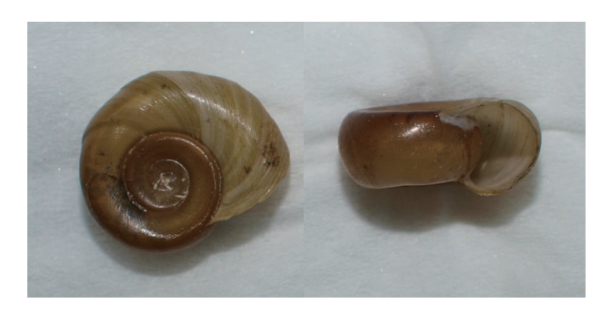
Fig. 1. Shell of Biomphalaria tenagophila from Rio de Janeiro, Brazil.

<sup>a</sup>A, acrocentric; M, metacentric; SM, submetacentric; ST, subtelocentric; T, telocentric chromosomes.