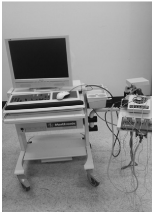
Fig 4. EMG