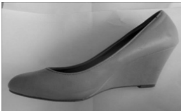
Fig 1. Wedge Heels

Generally, high heels are available in various heights and forms according to personal preference or style. The high heels commonly found now in stores include french heels, stacked heels, continental heels, setback heels, cuban heels, pantaloon heels, angle heels, dutch heels, flat heels and wedge heels(Jeong, 2004). In this study, we selected 3 types of high heels that were different in shape and function. Those selected for the study were wedge heels(Fig 1), setback heels(Fig 2), and french heels(Fig 3).