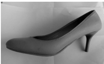
Fig 3. French Heels