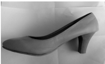
Fig 2. Setback Heels