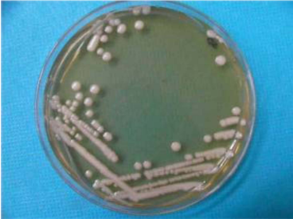
Fig 2. The colonies were cream-colored and glistening after 3 days of culture on Sabouraud dextrose agar.