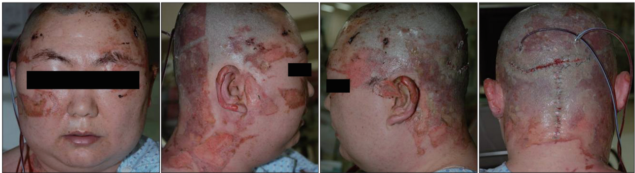
Fig. 2. Patient suffered second-degree burns on his cheeks, forehead and about 40% of the scalp.

flame in the fire. After the fire was extinguished immediately using saline, the surgical drape was removed.