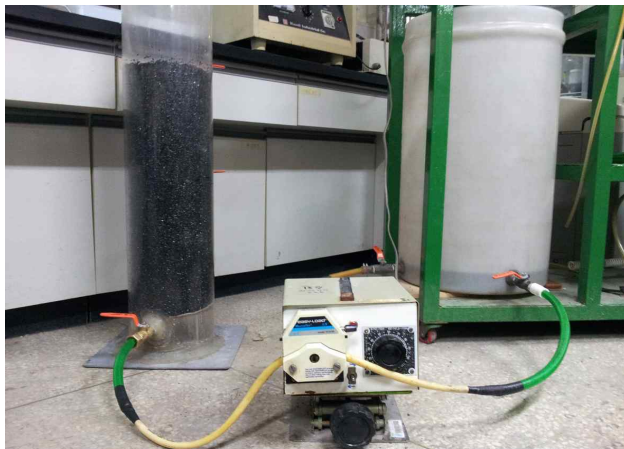
Fig 2. Up-flow type filter is connected to the device through the metering pump and the inlet sample