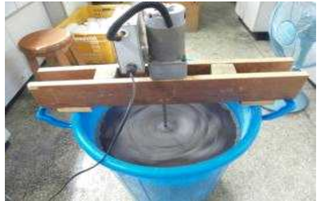
Fig 1. Production of artificial runoff water samples

The filter media used for the installable device can be divided into those for biological filtration method such as gravel or porous glass and those for physical adsorption method using microporous materials such as zeolite, anthracite, vermiculite, etc (Industry-Academic Cooperation Foundation of Semyeong