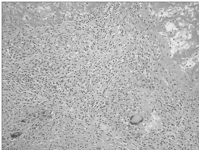
Fig. 3. A Langerhans cell is surrounded by lymphocytes and epithelioid cells in hematoxylin-eosin staining. Chronic caseating granulomatous inflammation is also seen ( \times 200 ).

vectomy and debridement was carried out, during which tissue biopsy was obtained for pathological and microbiological tests. In the pathological test, staining of the tendon sheath and the