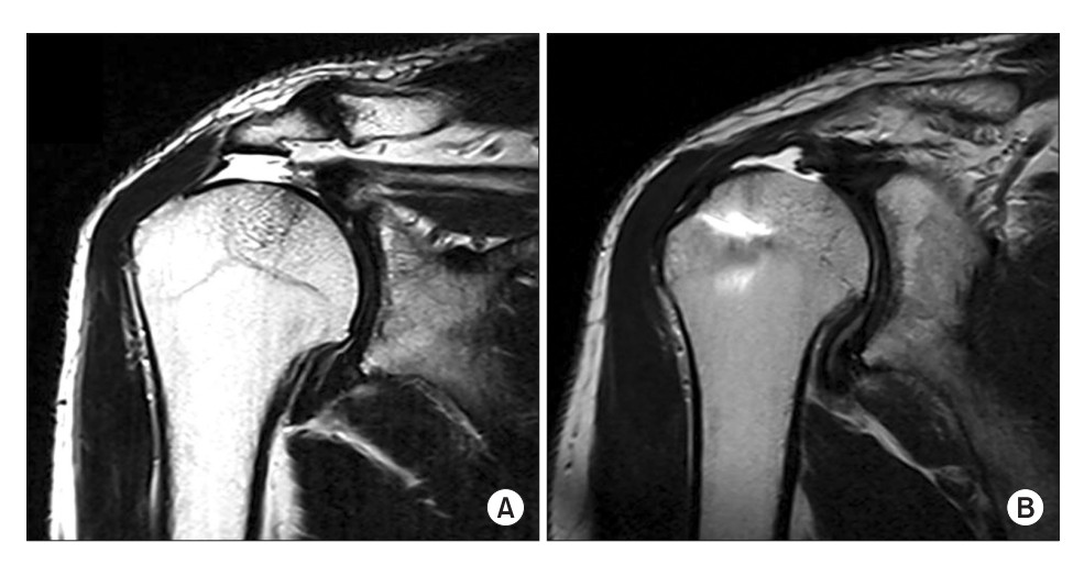
Fig. 2. (A) Preoperative T2-weighted coronal magnetic resonance image shows rotator cuff tear. (B) One-year postoperative magnetic resonance image shows retear of the supraspinatus tendon.