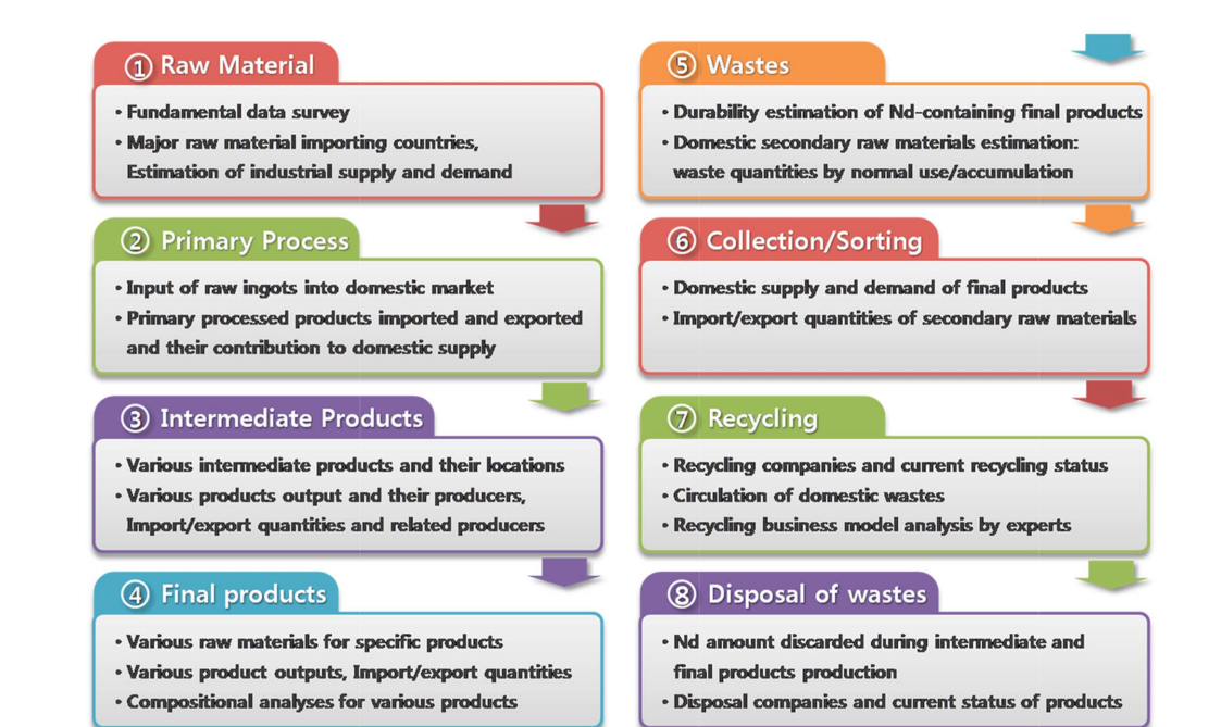
Fig. 1. Materials flow data collection summary.

sis method that is based on existing statistics (a top-down method that uses the inter-industry IO table) with that which is based on the complete enumeration for relevant companies (a bottom-up method that uses visiting surveys of raw materials importers and materials/parts/prod-uct manufacturers and recyclers), the problems with the material flow analysis (MFA) methodologies were supplemented and priority was given to the resulting reliability. The definitions and descriptions of the stages follow (Fig. 1).